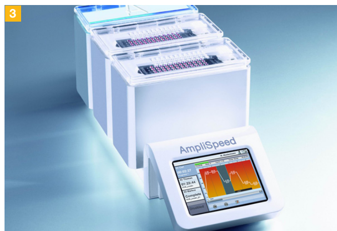
Figure 3: AmpliSpeed ASC200D slide cycler