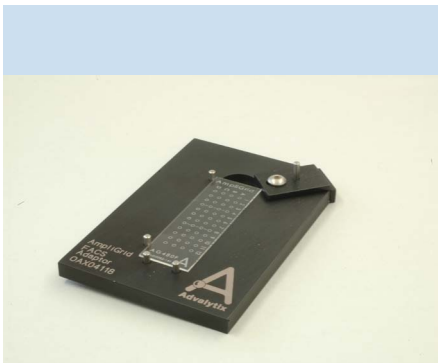
Cell Sorter Adaptor with AmpliGrid AG480F