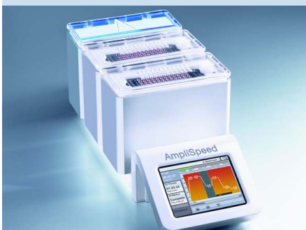
AmpliSpeed slide cycler