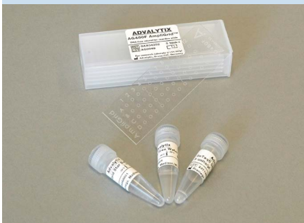
AmpliGrid GoTaq® PCR System