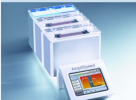
AmpliSpeed slide cycler