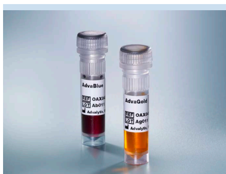
AdvaBlue / AdvaGold