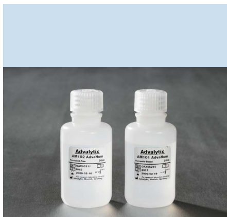
AdvaHum AM101 and AM102