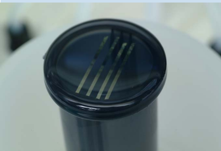
Slide positions in the AdvaTube