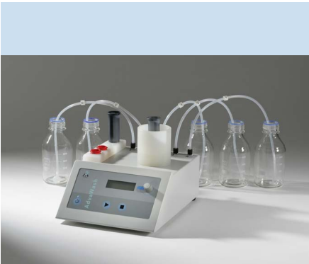
AdvaWash AW400 (Advalytix) including Advatubes