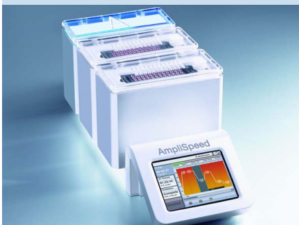
AmpliSpeed slide cycler