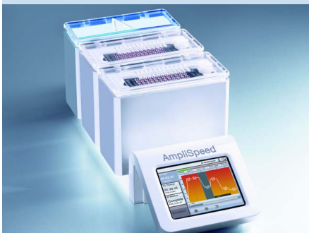
AmpliSpeed slide cycler