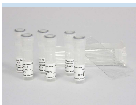
Single Cell RT-PCR Kit